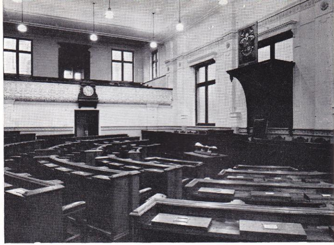
The Council Chamber