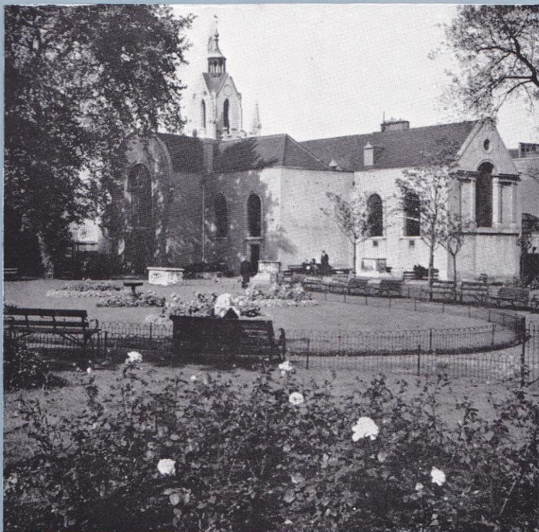
Relaxation in the Church Grounds St. Mary Magdalen (Bermondsey Parish Church)