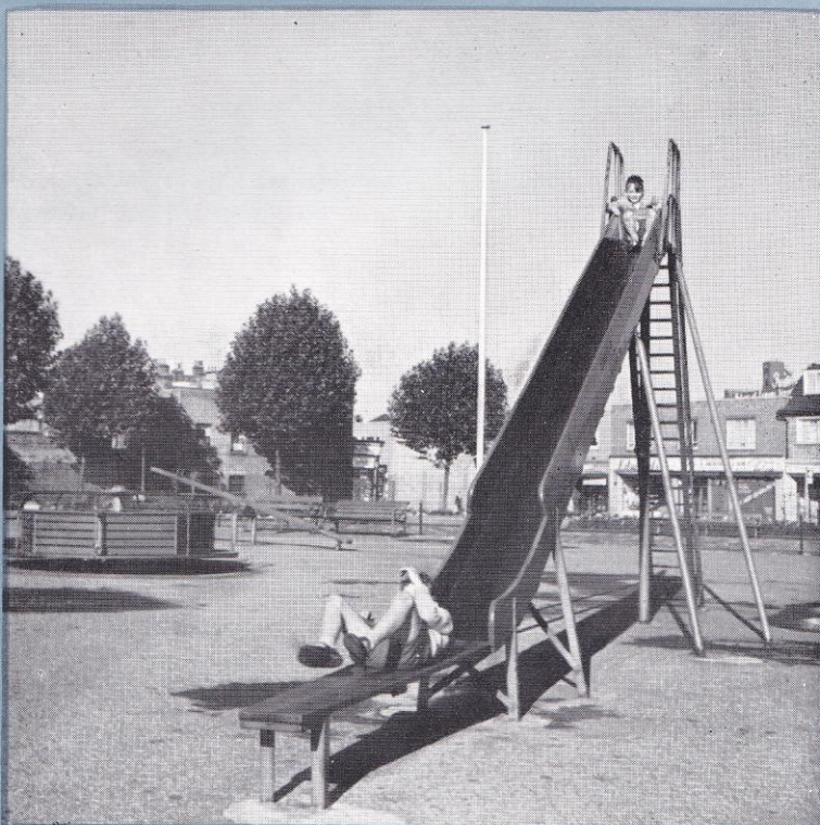
Shuttleworth Playground, Southwark Park Road